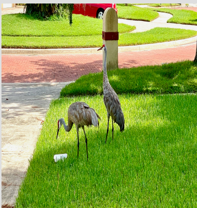
Sandhill Cranes spotted in the Rosemont neighborhood.

So the next time you're feeling unfit, put on a hat, your shoes, AirPods and head out the door for some healthy exercise and community bonding. It's where we live and to fully enjoy Rosemont, you need to dive in!