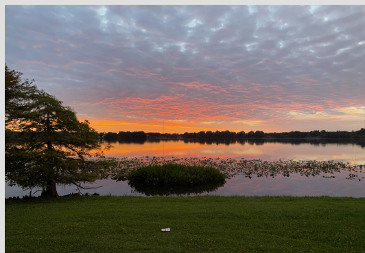
A breathtaking sunrise off Lake Orlando